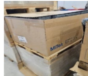
BigBox-pallet with packed bundles

Strapped bundles packed on a EUR pallet with corrugated cardboard lining. The pallet height is about 630mm which means there is room for two pallets on one pallet space.