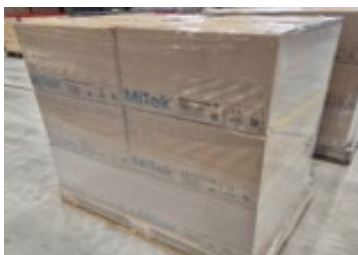
Loose-packed plates in boxes

Loose plates in 330mm high boxes. One pallet holds 12 boxes.