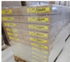
Packed bundles in boxes

Banded bundles packed in 110mm high boxes.